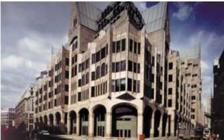
Sirius' London Office at the London Underwriting Centre.

Growing year by year, expanding globally, building upon a solid reputation, remaining stable but never standing still – these characteristics make IMG and Sirius International the partners to choose for your Global Peace of Mind SM .